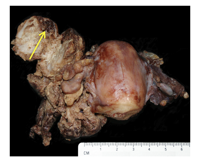
Figure 2. Gross pathology of uterus from rhesus macaque with endometriosis. The ovaries and fallopian tubes are embedded and distorted by accumulation of solid fibrous masses (scar tissue) and formation of endometrial cysts (arrow shows an open large cyst with yellow fibrous nodules in the center and dark red-brown fluid seen at the edge).

Both BPRC and NEPRC maintained complete medical records and familial relationships on all colony animals. After death, all animals were necropsied within several hours of death, often immediately following euthanasia, and representative sections of tissues were collected, flash frozen, and stored at -80 °C, as well as fixed in 10% neutral buffered