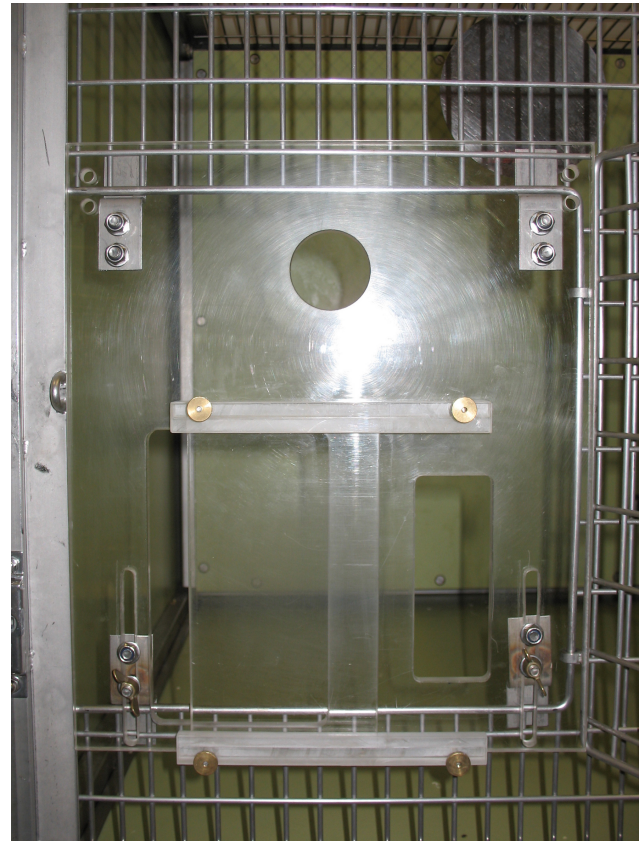
Figure 5. Cages may have to be changed to accommodate training practices – here a plexiglass “door” allows protected contact with the animal.

Additionally, the personnel involved in training need the required skill and experience to apply reinforcement techniques and systematic desensitization and countercondition-