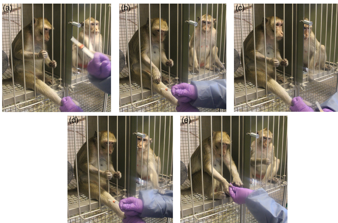
Figure 2. PRT training sequence in a long-tailed macaque ( Macaca fascicularis ). At this stage in training, the animal is already holding the bars, presenting the right leg and allowing the trainer to grasp it. (a) The trainer presents a capped syringe: the animal is holding on to the bars. (b) The animal lets go of the bars and reaches for the syringe, an unwanted behaviour. (c) The trainer withdraws the syringe; the animal recovers the desired position (holding the bars). (d) The trainer presents the syringe again; this time the animal holds on to the bars and accepts being touched by it. (e) The animal receives positive reinforcement: treats. Note that bar holding is a type of targeting (see below) and also a behaviour incompatible with reaching for the needle – it is impossible to do both at the same time. Unwanted behaviour is not simply ignored: removing the syringe (c) negatively punishes the unwanted behaviour (the chance of earning reinforcement is postponed). Also, at this stage of training there is no needle on the syringe. The neighbour is also keen on training but presently ignored.

be used to help the animal move quickly through the confusion – once they understand the training concept, more advanced behaviours can be taught in the later stage of accelerated learning. Below, a simple behaviour shaping plan is demonstrated (target training).