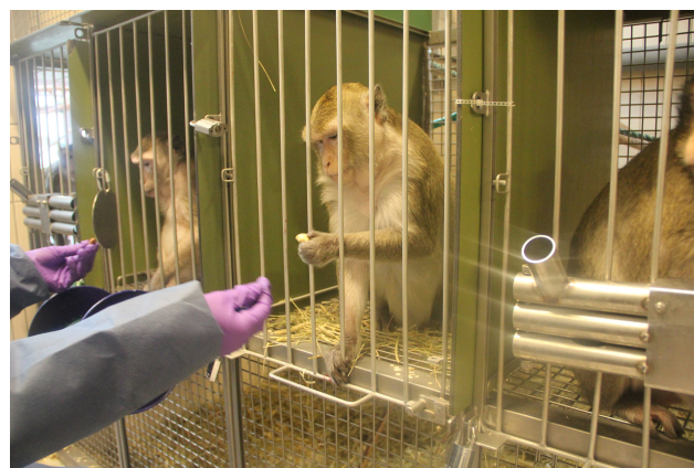
Figure 4. Visual barriers may separate a group of animals during training sessions. Here, the animals are in a training tunnel adjacent to their indoor/outdoor cages and may leave their training positions at any time.

In training, one thing to keep in mind is what the animal's preferences are when choosing a training position. Arboreal species enjoy observing their surroundings from an elevated platform, looking down. When attempting to train an animal, it is often wise to start when the animal is in a position with a sense of control, such as perching in a favourite elevated platform, or in companionship with favourite cage mates – although training several animals in a group may entail challenges. Isolation of social animals is a potential stressor and must be used conscientiously.