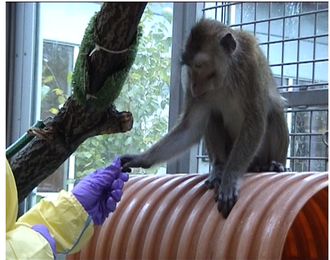
Figure 1. Caretaker interacting with long-tailed macaque ( Macaca fascicularis ).

Non-human primates communicate with facial expressions and postural displays, in addition to auditory and olfactory cues. Therefore, it is important to come across as non-threatening or neutral. Loud voices, laughing, staring, and fast movements can all be unsettling or even threatening to a primate. It is important to know the basic behavioural repertoire indicating affective state (in primates ranging from head bobbing to showing the teeth, presenting hind quarters, and scenting with urine) of the species in question (see Wolfensohn and Honess, 2005). However, the caretaker can try to mimic friendly contact sounds or facial expressions (e.g. lip smacking) of the species in question. A word of caution when working with primates: avoid getting caught up in a power struggle and try not to compete for rank with a monkey. The animal should respect the caregiver but not try to fit the person into its own social hierarchy.